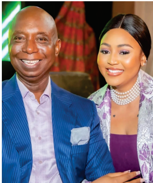
Senator Nwoko focused on his duties

The senator's team explained that, as a well-known public figure, Nwoko is often targeted by baseless rumors. His wife, Regina Daniels, is a Nollywood actress, making their family an easy target for media speculation. However, the office condemned the spread of false information and urged journalists and bloggers to verify their sources before publishing unconfirmed reports.