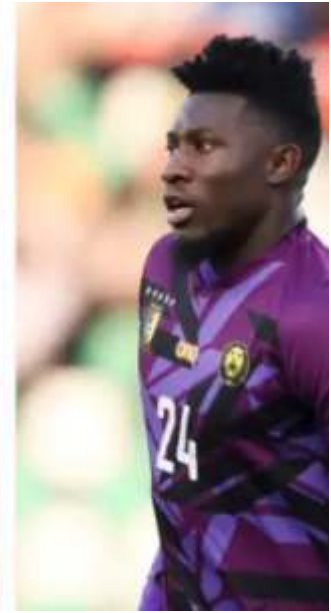
Comoros v Mali (2100)