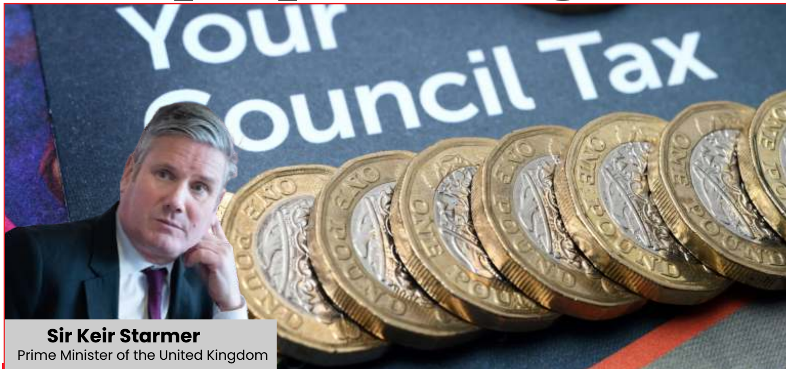
Sir Keir Starmer