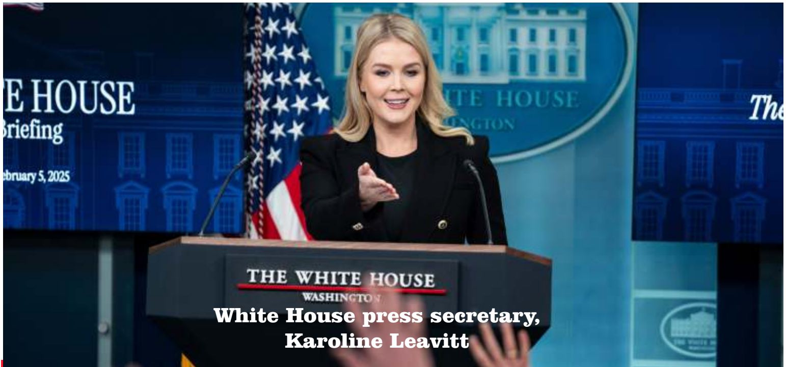
White House press secretary, Karoline Leavitt

● White House press secretary, Karoline Leavitt confirms talks Pg 35